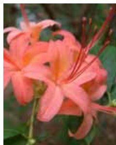
Bloodworth, Stefan, Lady Bird Johnson Wildflower center,

Perennial shrub. Part shade, moist soil, drought sensitive. Multi-stemmed, loosely branched, spreading shrub with dark green leaves, 8-12' tall and wide. Multiple bunches of 3-6 white to pink fragrant flowers with carmine stamens and pistil. Blooms late Summer, fruit, upright cylindrical capsule are ripe Sept - Feb. Hummingbird forage; nectar for Swallowtails, Gulf Fritillaries and migrating Monarchs. Larval host for: Spicebush Swallowtail Butterfly.