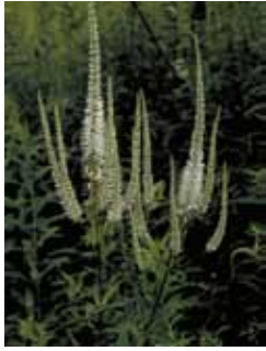
Vick, Alfred F.W., Ladybird Johnson Wildflower Center

$10.00 1 gal. Vernoniastrum virginicum Culver's Root Perennial herb. Full sun to part shade, well drained moist to average soil. Upright, unbranched stem with whorled dark green leaves that puts forth a spike of flowers at the top, 3-5' tall with numerous small white flowers resembling a bottlebrush. Blooms for 4 weeks during Jun-Aug. Dark brown very tiny seeds in a dark brown capsule, Sept-Oct.